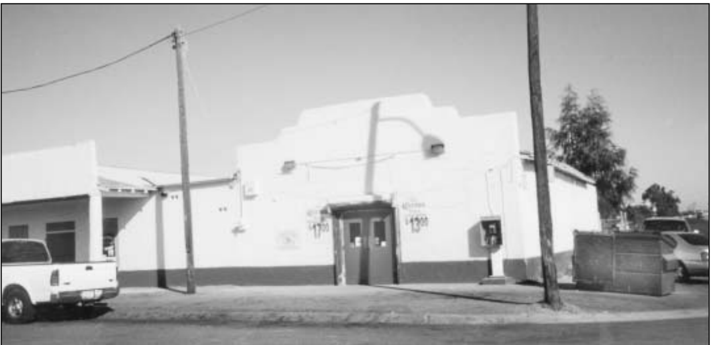
This popular neighborhood market, which is known by many names, such as Poncho's, Simon's and Austin's, has been around since the 1950s.