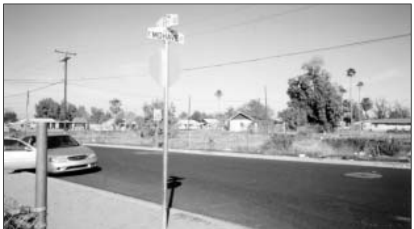
Pictured is Don's large vacant lot property on 11th St. and Mohave.