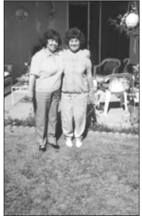
The Cain sisters are pictured in front of Fayetta’s house.