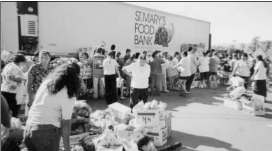
Wesley Community Center holds a monthly food distribution for the entire neighborhood.