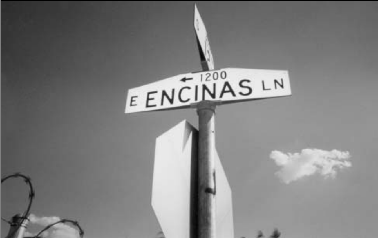
The Encinas family has two streets named for them in Phoenix and Guadalupe, Arizona.