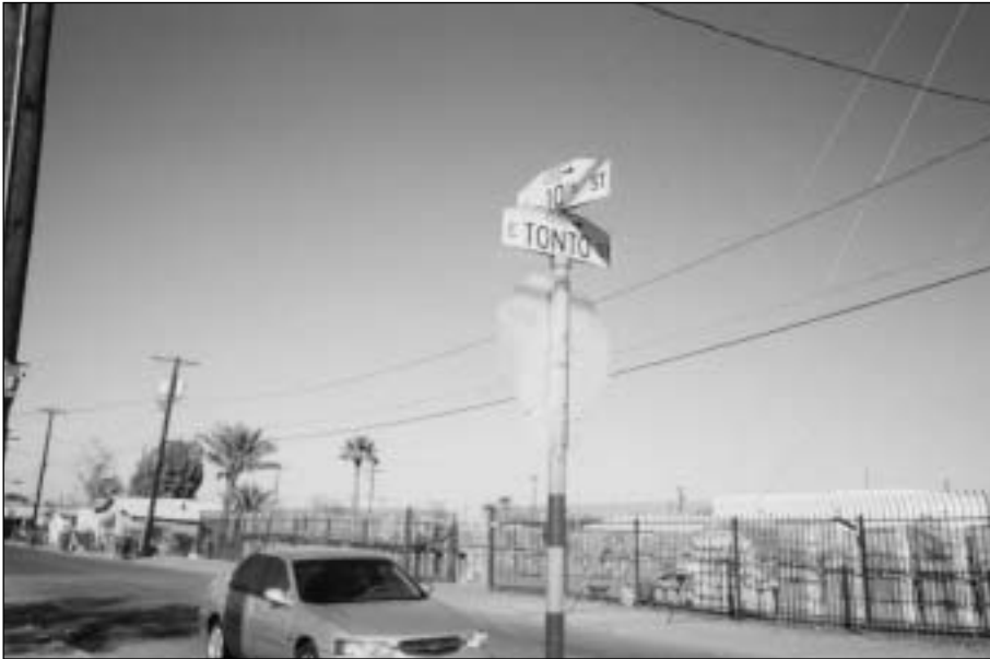
10th St. and Tonto St. - Former site of an old, popular neighborhood tavern, the “Hollywood Bar” in the Campito neighborhood.