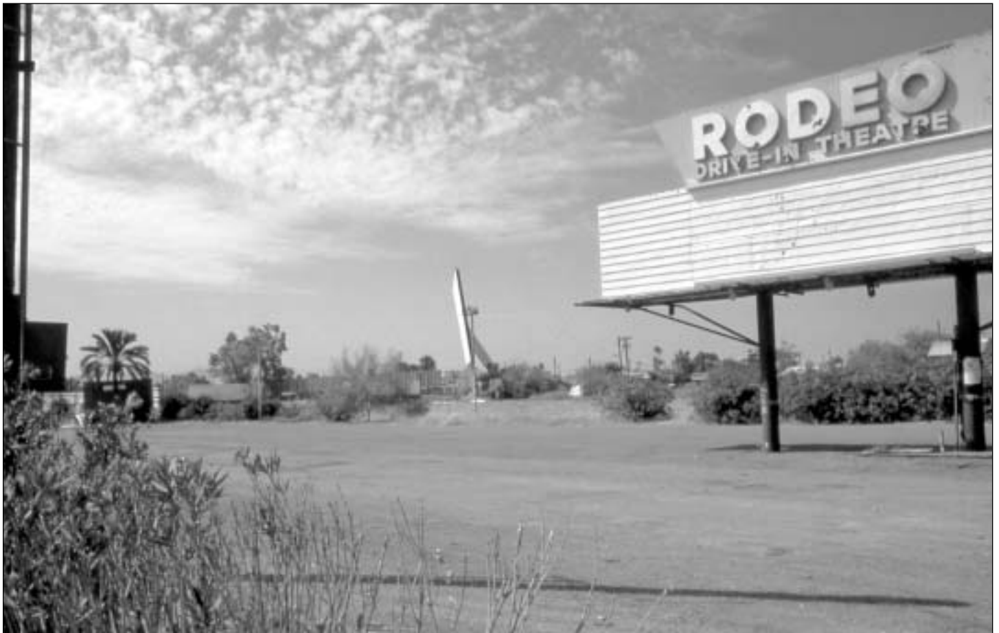
"The Rodeo Drive-In was situated in the middle of the neighborhood where residents could actually watch movies from their yards and rooftops."