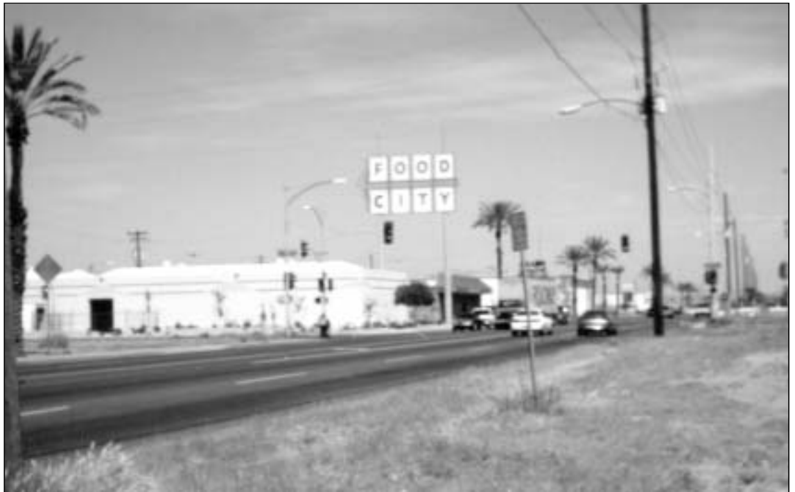
Food City has served the community since the early 1930s when it was known as Kirk's Food City.